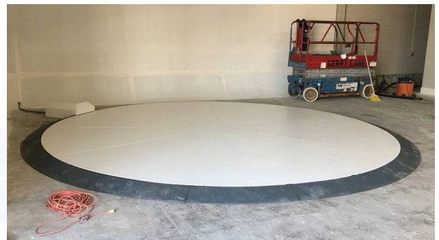
TURNTABLE WITH WHITE FINISH, UPON COMPLETION OF INSTALLATION